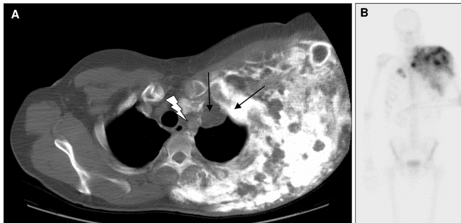
Figure 2 Radiological features 4.5 years after the first symptoms. (A) CT scan: thoracic transversal view showing a voluminous heterogeneous highly calcified mass. It included the whole left chest wall and the left scapula, with intercostal invasion to the apical pleura (black arrows) and the antero-superior mediastinum (bolt) with trachea deflection to the right. (B) Bone scan with Technecium 99: see the heterogeneous extended hyperfixation of the whole left side of the chest. There was a muscular extension to the triceps leading to a frozen scapulo-humeral joint.

multipotent mesenchymal cells contained in soft tissues. Evolution is slow, and the diagnosis is delayed with a median interval after the discovery of the mass of 4 years (range, 2 to 10 years). This delay explains the large size of tumours at diagnosis (median 14 cm, ranging from 5 to 30 cm). However, high-grade histological features (dedifferentiation and high mitotic activity) may appear after a long period in analogy to what happens in low-grade