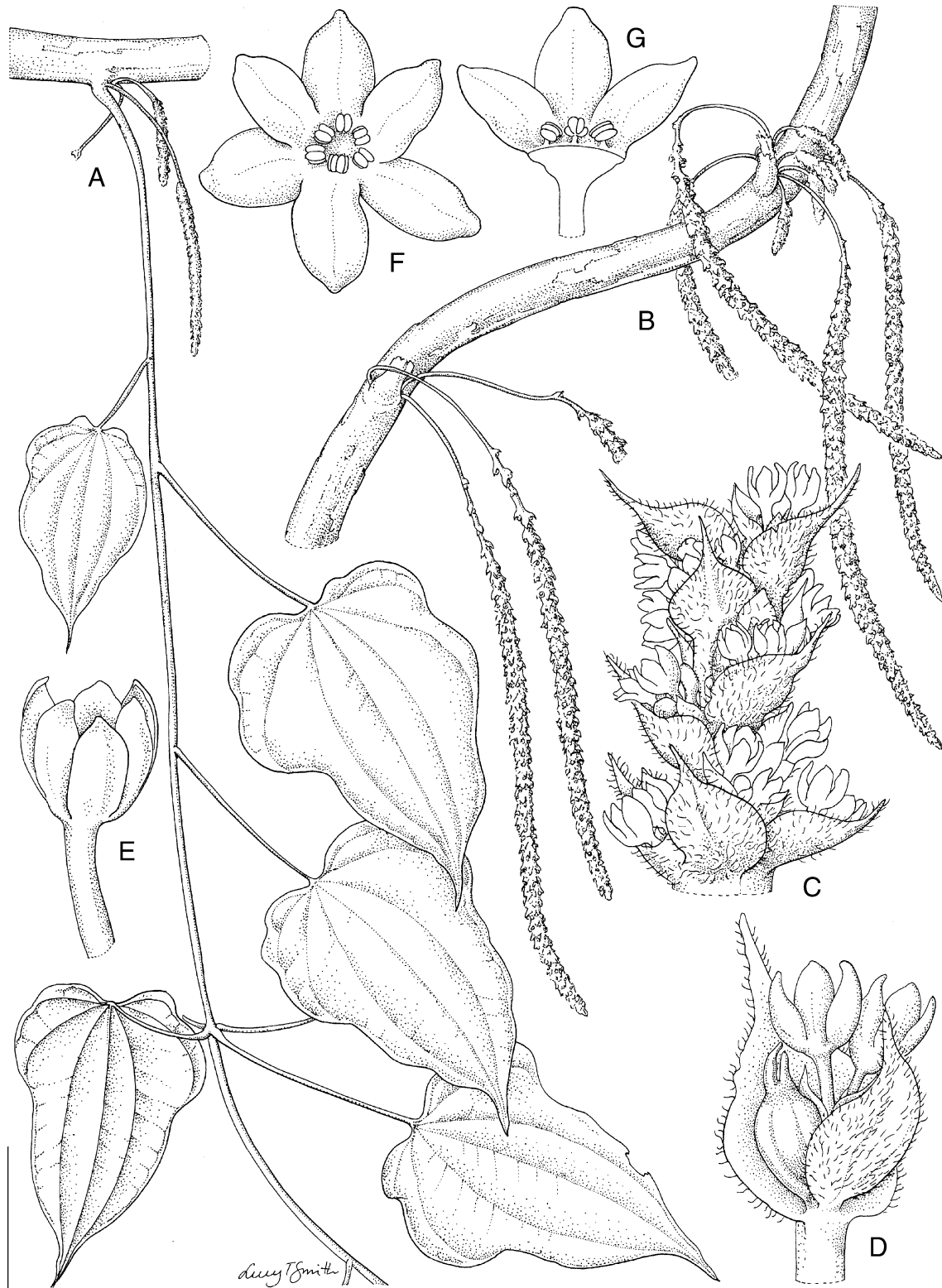
Fig. 1. Dioscorea bako vegetative and male floral morphology. A habit, showing the leaves and one of the uppermost inflorescences in the axil of a vegetative branch; B stem towards its base, showing the dense inflorescences on short specialised leafless shoots in the axils of cataphylls; C section of an inflorescence, showing the cymule bracts and flowers concealing the axis; D single cymule, showing its insertion on part of the axis, a cymule bract and bracteole (pubescent), the sessile sterile flower at the cymule base and two open flowers on the cymule with their pedicels; E flower in the process of opening, side view; F open flower, top view, showing the two whorls of stamens; G a half-flower (longitudinal section) showing the discoid torus and the insertion of the tepals on to it. A from Rajaonah MT 057, B – G from Rajaonah 006. Scale bar: A, B 2.5 cm; C 3.3 mm; D 1.7 mm; E – G 1.2 mm. DRAWN BY LUCY SMITH.