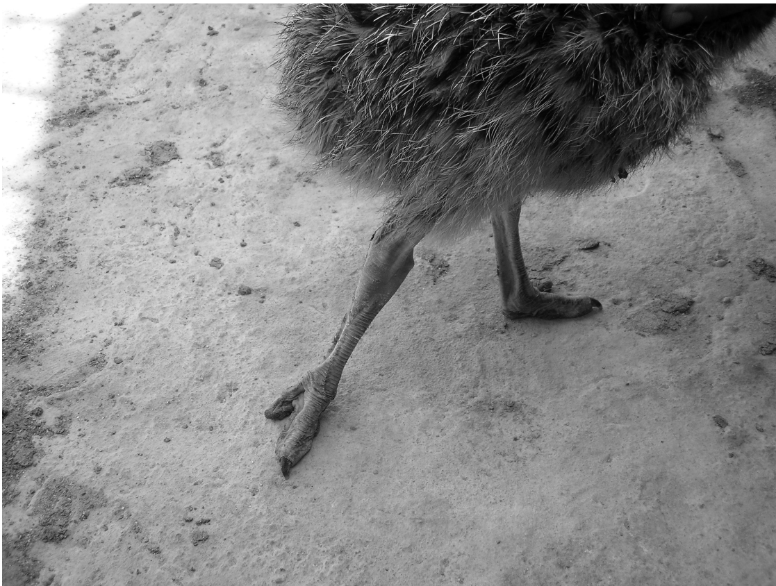
Figure 3. Severe twisting of limbs in bow leg ostrich chick.