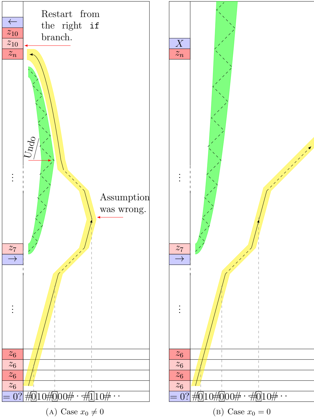
FIGURE 2. Branch if equal to 0 thread