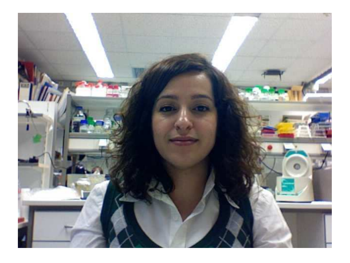
225x169mm (72 x 72 DPI)