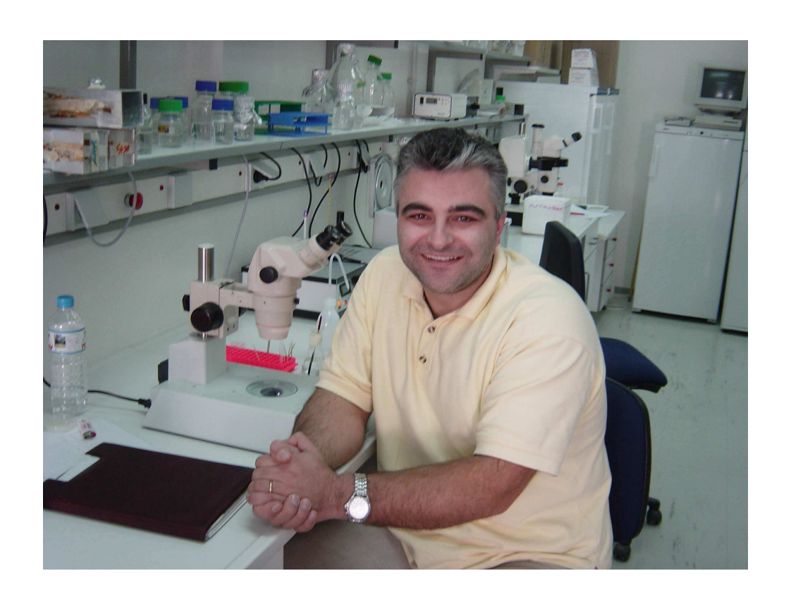
801x601mm (72 x 72 DPI)