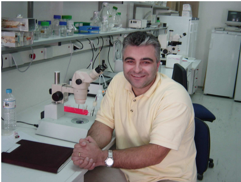
801x601mm (72 x 72 DPI)

1 2 3 4 5 6 7 8 9 10 11 12 13 14 15 16 17 18 19 20 21 22 23 24 25 26 27 28 29 30 31 32 33 34 35 36 37 38 39 40 41 42 43 44 45 46 47 48 49 50 51 52 53 54 55 56 57 58 59 60