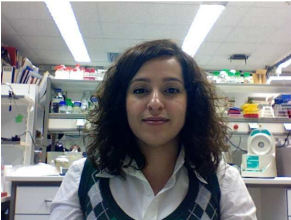
225x169mm (72 x 72 DPI)

1 2 3 4 5 6 7 8 9 10 11 12 13 14 15 16 17 18 19 20 21 22 23 24 25 26 27 28 29 30 31 32 33 34 35 36 37 38 39 40 41 42 43 44 45 46 47 48 49 50 51 52 53 54 55 56 57 58 59 60