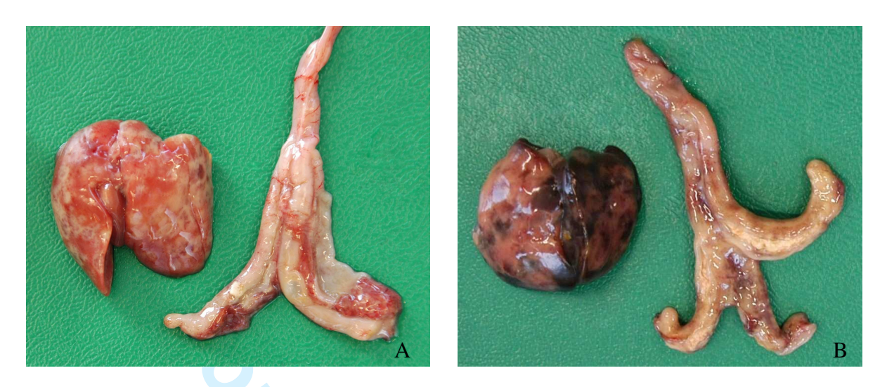
Figure 2. Livers and caeca of individually housed turkeys (experiment 2) following infection with cultured H. meleagridis via the cloaca (A) (bird no. 5) or crop installation (B) (bird no. 9).