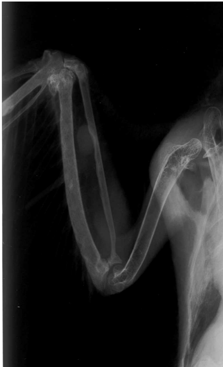
Osteolytic changes on the right wing affecting ulna, radius and metatarsus, African Grey parrot, radiograph ventrodorsal view. 20218x32918mm (1 x 1 DPI)