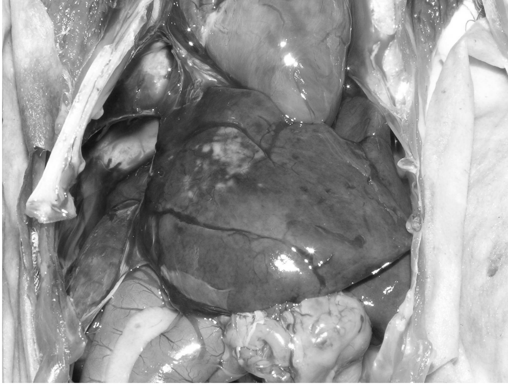
Liver showing a red-green mottled colour and bifocal nodules of yellow colour with solid consistence and a dimension of 0.5 cm diameter, African Grey parrot, situs post mortem. 722x541mm (72 x 72 DPI)