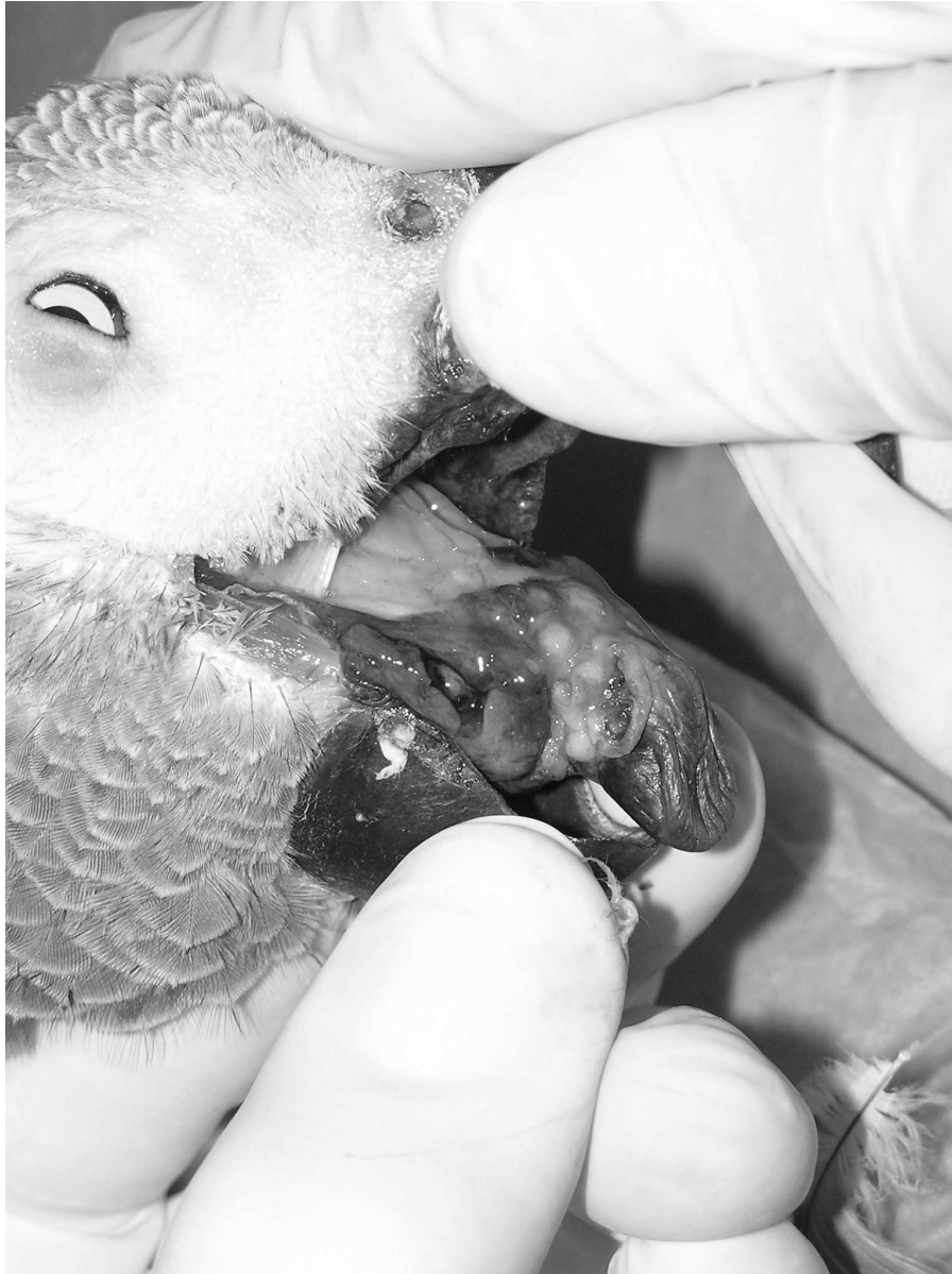
Multiple white-yellow sublingual nodules with a dimension of up to 0.5 cm diameter and a yellow friable content, African Grey parrot, post mortem. 541x722mm (72 x 72 DPI)