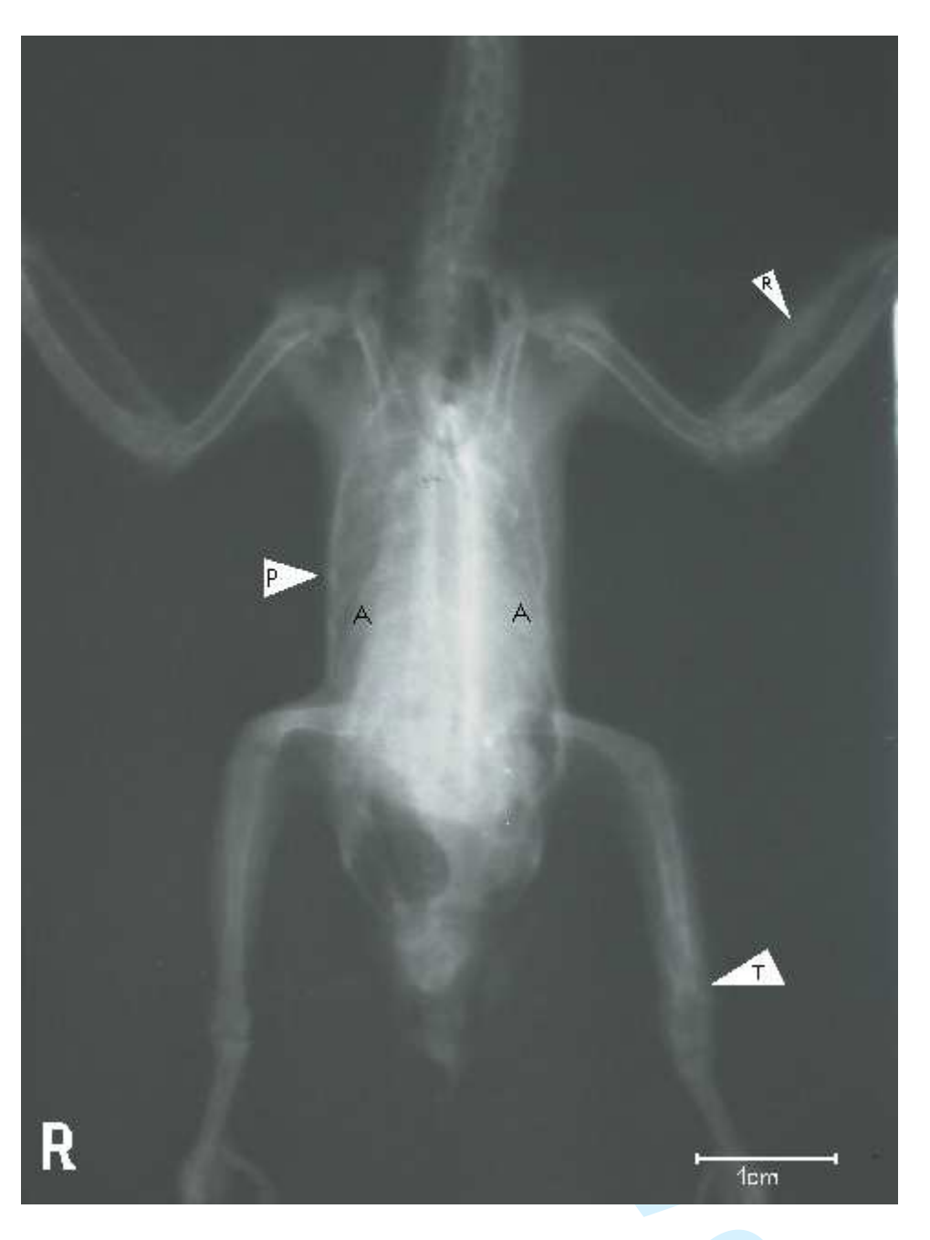
Fig 1. Ventrodorsal radiograph of budgerigar infected with M. bovis . Radiograph indicate radial (R) and tibiotarsal (T) left bones' lesions and marked atrophy of pectoral muscles (P) as well opacity of thoracic air sacs (A).