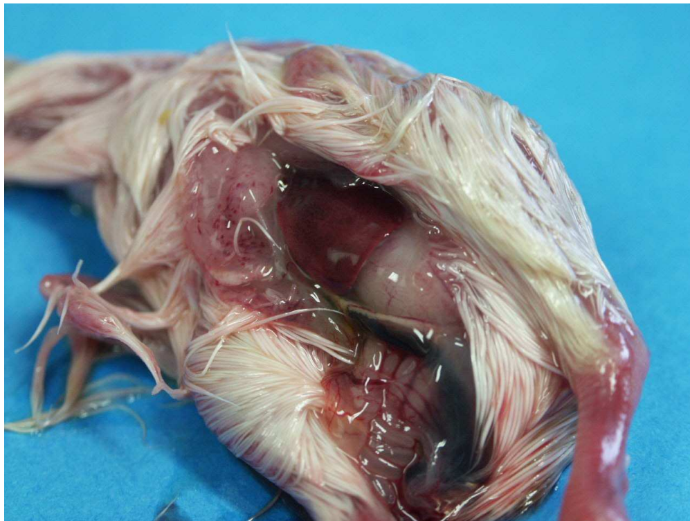
Fig. 2 Petechial haemorrhages in a turkey embryo 19 days after inoculation (27th day of incubation) with 2 \times 10^2 CFU of M. lipofaciens (strain ML64). 451x338mm (72 x 72 DPI)