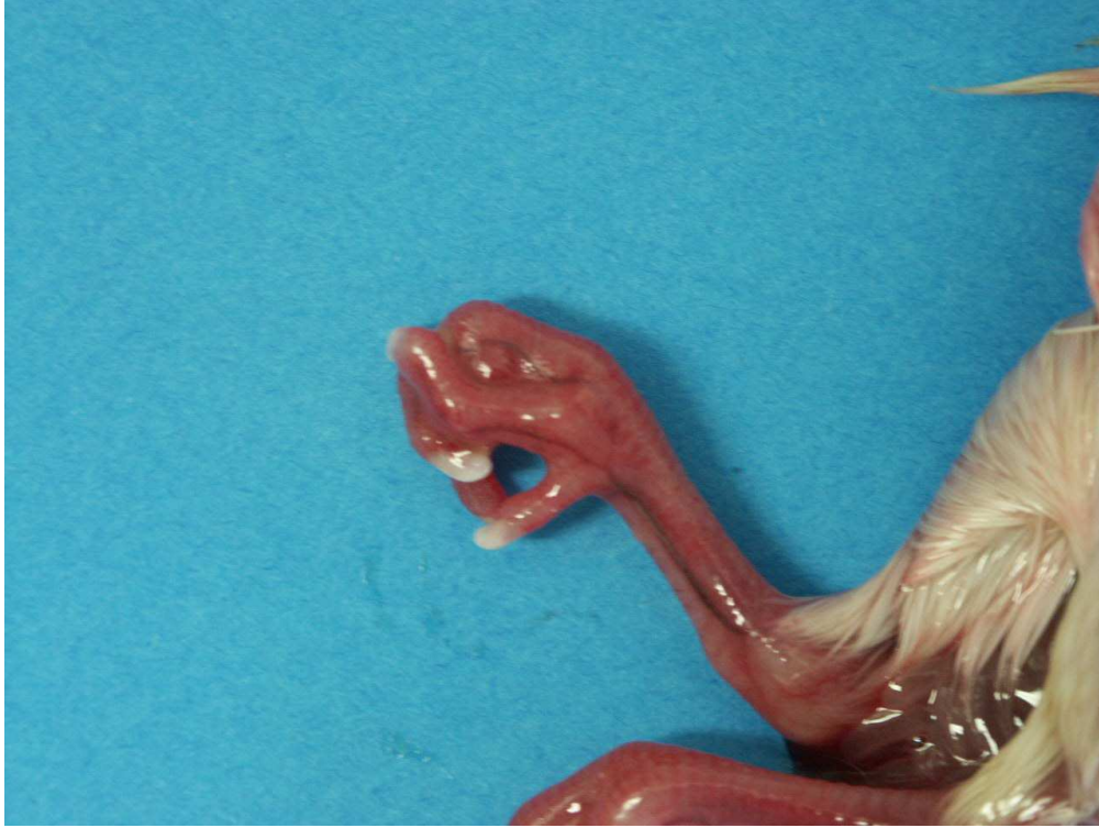
451x338mm (72 x 72 DPI)