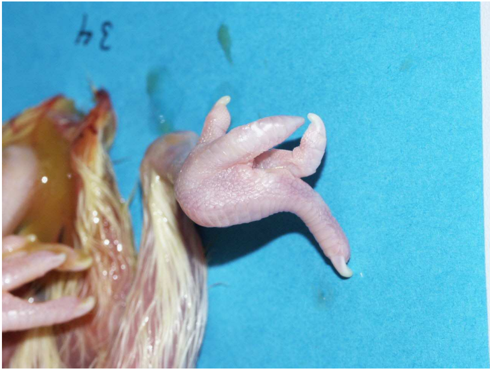
451x338mm (72 x 72 DPI)