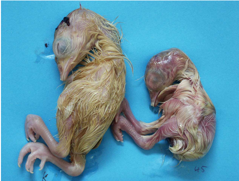
Fig. 3 Right: Dwarfed turkey embryo, 20 days after inoculation (28th day of incubation) with 2 \times 10^2 CFU of M. lipofaciens (strain ML64). Left: Turkey embryo of the control group at same age for comparison.