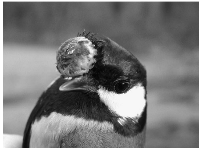
Fig. 1 A great tit with characteristic skin avipoxvirus lesion.

DNA was isolated from pox skin lesions of two great tits in which poxviruses were found by electron microscopy. DNA was isolated using the NucleoSpin® Tissue kit (Machery–Nagel) according to the manufacturer's instructions. Skin lesions were cut into small pieces prior to DNA isolation. Tissue samples were lysed overnight at 56°C in the presence of the lysis buffer and proteinase K. Polymerase chain reactions (PCRs) were performed using a pair of primers complementary to a partial sequence of gene encoding for the 4b core protein in conditions described previously (Lee and Lee 1997) and primers for amplification of a sequence of orthopoxvirus ATI body protein gene (Meyer et al. 1997). DNA fragments were visualized on 1% agarose gel stained with ethidium bromide. PCR products of the amplification of a portion of the 4b core protein gene were purified using QIAquick® PCR Purification kit (Qiagen), resuspended in 50 µl of redistilled water, and