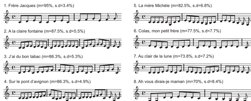
FIG. 1. Musical scores of the eight familiar French melodies. The results from the identification task where the melodies were presented alone are indicated in brackets (mean percent of correct identification, standard deviation)