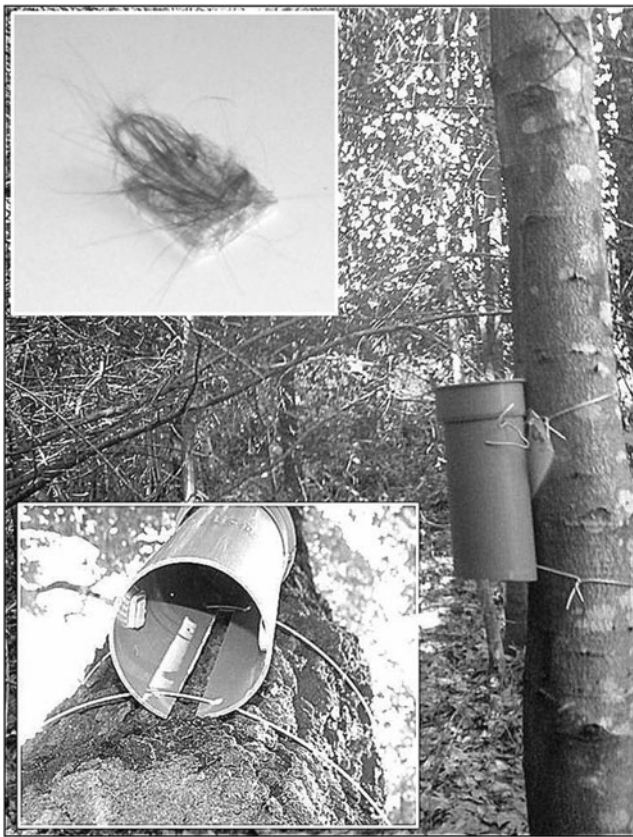
Fig. 3 A hair-tube in place during the population census. Remotely plucked hair ( top inset ) was obtained by placing two glue patches inside the tube ( bottom inset ), which the animal had to brush past to reach the bait. The entire device was attached to the tree with flexible aluminium wire, which was adjusted to suit the diameter of the tree trunk

rates per locus varied with three loci error-free in this analysis (Ma2, Mel1 and Mvi1341) and two loci (MLUT27 and Mer041) with error rates of 9.3% and 11.4% for allele dropout and false alleles, respectively. Full multilocus microsatellite genotypes were obtained for 49 plucked hair samples after multiple-tubes genotyping. Amplification success for the ZF gene was 93.8% (30 males and 16 females). Seven unique microsatellite genotypes were identified in total, giving minimum population sizes of five (three males and two females) in Curraghmore and two (one male and one female) in Kill. The number of times each individual was detected in the survey varied from one to 18 with some individuals detected at several sites within and across capture sessions, while others were detected only once in the survey.