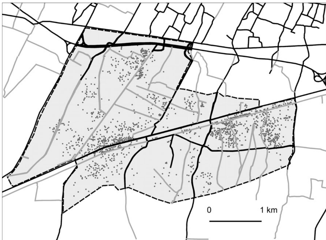
Fig. 1 Distribution of roads (asphalt road in black and gravel in gray ) and pheasant locations in the study area in the plains

locations (Table 1). Roads were not placed randomly in the two areas (Figs. 1 and 2), especially in the hilly area, where they mostly followed the crest of the hills, avoiding valley bottoms. Wild pheasants were trapped using funnel traps during January and February 2005–2007 and equipped with a radio-collar that lasted until October–November. Traps were opportunistically placed in areas most suitable for capture, irrespective of roads; several trapping sites were utilized at different times, according to weather and manpower. Not all the locations were known to us; therefore, it was impossible to test the true randomness of their placement. However, an eventual nonrandomness would only have influenced the first of our tests and not the second