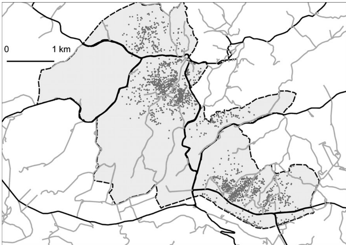
Fig. 2 Distribution of roads (asphalt road in black and gravel in gray ) and pheasant locations in the study area in the hills

(centroid minimum convex polygon (MCP), see “ Materials and methods ”). Pheasants were released immediately after marking in the same areas where they were trapped. Average radio mass was 18.5 \text{ g} \pm 3.0 \text{ SD} (1–3% of total body mass) and operated on the 151.001–151.999 Mhz frequency range (Venturato et al. 2009). Radio tracking was conducted by triangulation at least twice a week during daytime, and when an individual was found in the same location on two consecutive occasions, it was homed in to verify its state (dead/alive), as the transmitters did not have a mortality sensor. Standard techniques were used to determine the location of the animal (White and Garrott 1990). Two bearings were taken at very short interval (generally less than 3 min) and as close as possible to 90^\circ from each other. In case of doubt, additional bearings were taken. Precision of location estimate was confirmed by frequent resights. If radio contact was lost, wider searches were conducted in the whole area and in the surroundings (in a radius of >3 \text{ km} ), with the help of an omnidirectional antenna mounted on the roof of a car. We continued tracking until the death of the animal or the disappearance of the radio signal.