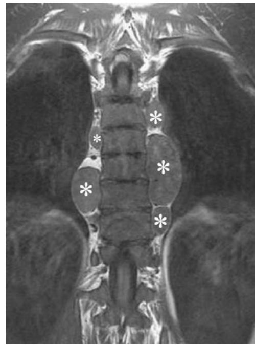
Fig. 2 Coronal spin echo T1-weighted MR image showing hypointensity of the vertebral bodies and paravertebral masses (asterisk)

forced expiratory volume in one second of 49%, forced expiratory volume in one second/vital capacity of 53% partly reversible after betamimetics, and carbon monoxide transfer factor of 42%. Fiberoptic bronchoscopy was normal, and bronchoalveolar lavage failed to detect hematopoietic cells. Treatment with oxygen, betamimetics, anticoagulants, and bosentan was given with relief of dyspnea (NYHA class II), decrease of mean pulmonary arterial pressure evaluated by right heart catheterization at 40 mmHg, and cessation of oxygen treatment.