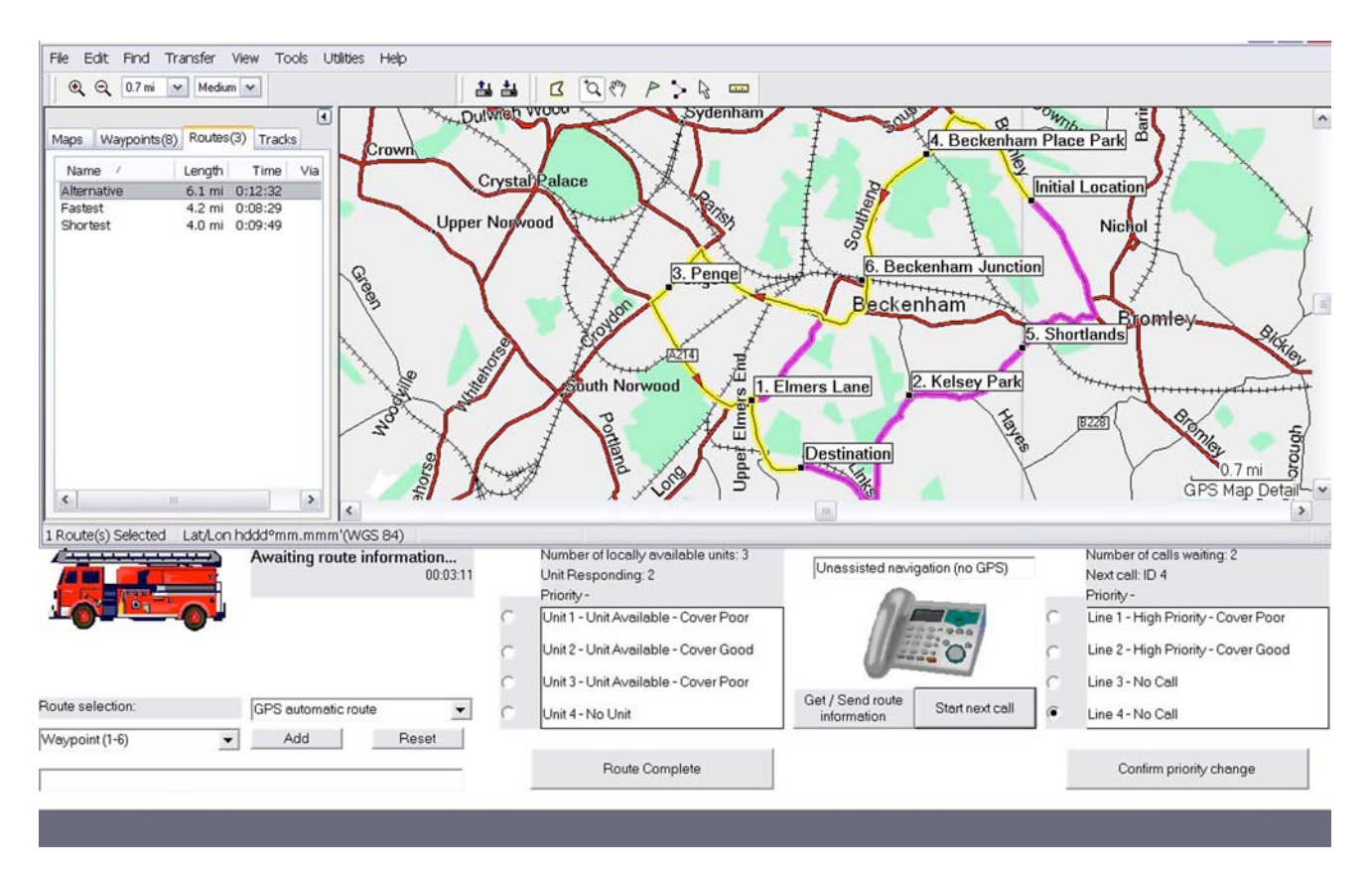
Fig. 3. 'Fire Engine Dispatch' interface