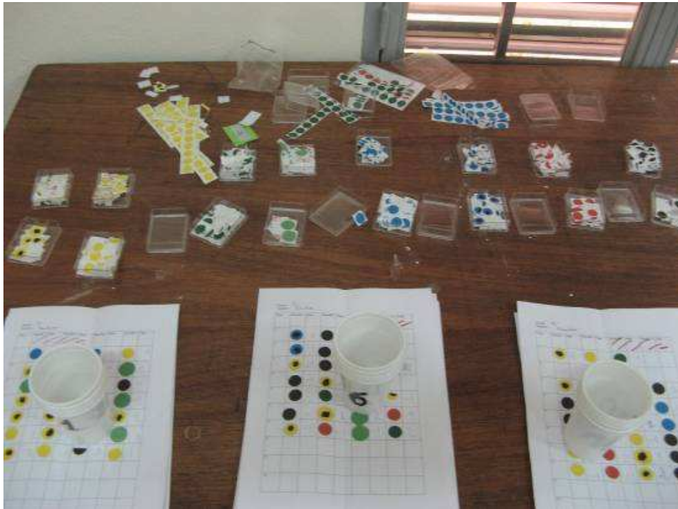
FIG 1 : Assitants table with reserves of seeds at the back and at the front players sheets with their choices for several years and players cups with seeds inside ready for being distributed back