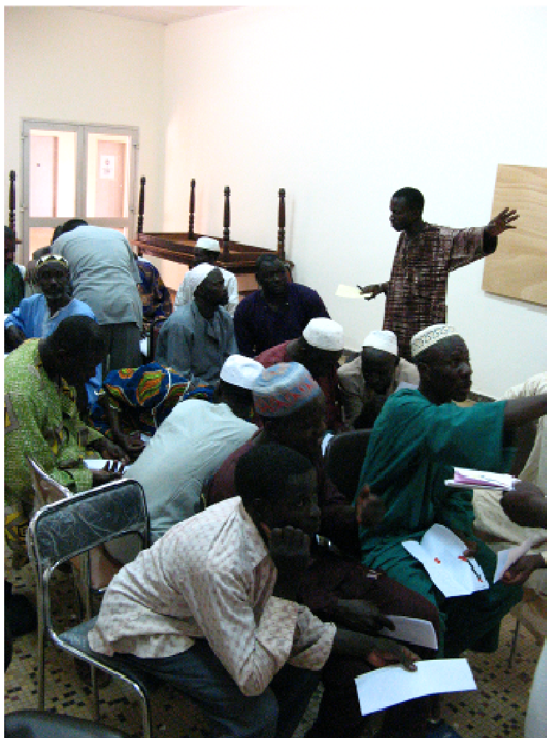
FIG 4 : Lines of players interacting and discussing