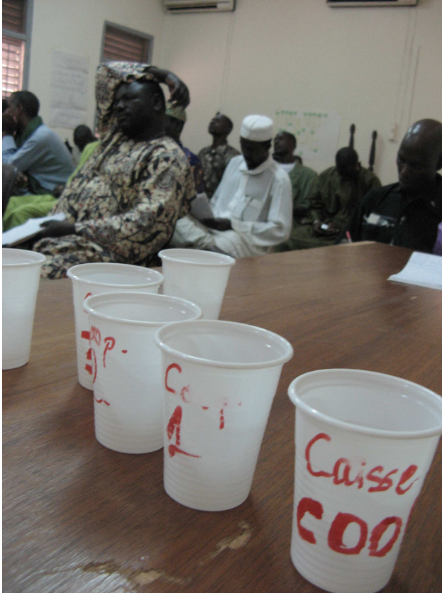
FIG 5 : the cooperative simulated in the game : the cashbox where member put their cotisations and the stocks of the different varieties