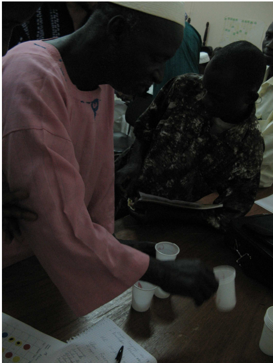
FIG 6 : the cooperative manager in action checking how he can answer requests from its members