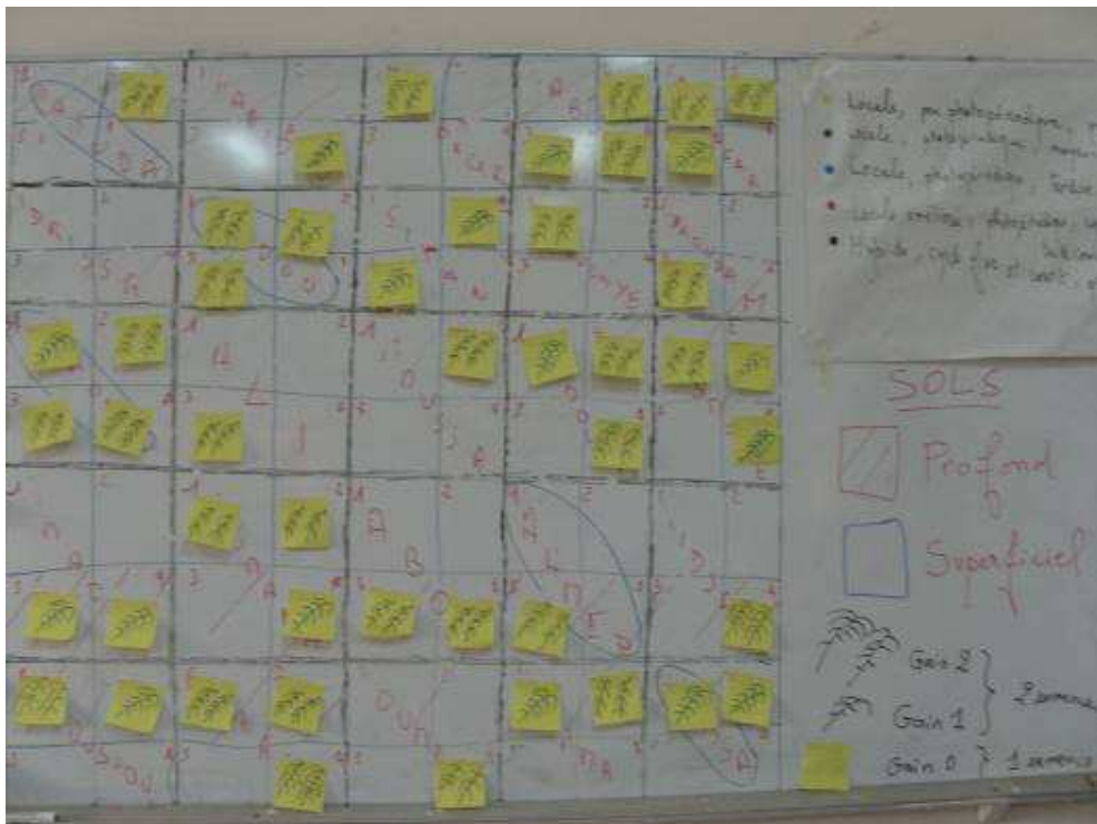
FIG 2 : Display of fields and harvest level on white board