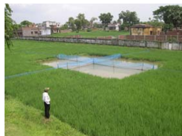
Photo 1. Rice-fish System

Rice-fish culture is useful in productive utilization of seasonally waterlogged lands in canal command with depth of water stagnation upto 0.5 meter. Trial was undertaken to grow fish in the rice fields with central pond type fish refuge covering 10% of rice field area (Photo 1). Different options like fresh fingerlings and stunted yearlings were tried.