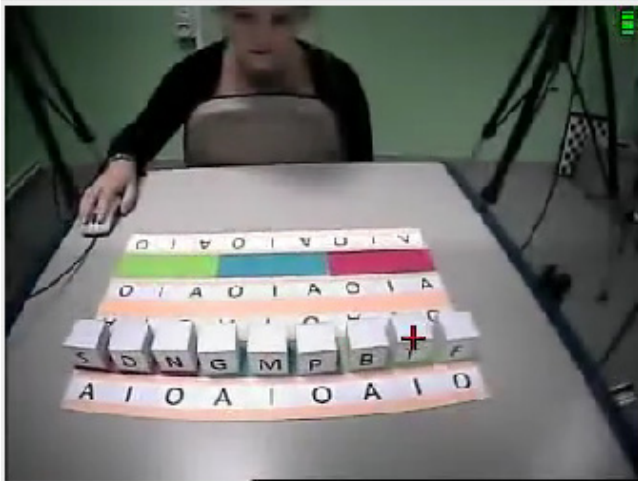
Figure 2. Point of view of the “informant” who can see the consonant labeled cubes.

Thus while it is clear, even intuitively, that gaze is of central importance, one must ask what precisely are the characteristics of gaze control that will allow the most productive behavioral alignment between two partners in a cooperative task? In order to address this question, Fagel and colleagues have developed a human-human cooperation scenario in which speech and gaze are crucially involved [7]. The “Cube Game” task is illustrated in Figures 1 and 2. Two human subjects (the “informant” and the “manipulator”) are seated face to face across a table. On the table is arranged a set of cubes that are labeled with the consonants {T, G, P, D, S, F, M, N, B}. Importantly, only the informant can see these consonant labels.