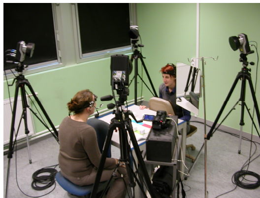
Figure 1. Face-to-face human interaction laboratory set-up (GIPSA-Lab).

One of the most central and important factors in the ongoing management of cooperative human interaction is the use of gaze to coordinate that one’s interlocutor is present, paying attention, attending to the intended elements in the scene, checking back that all is ok [5]. In this context, gaze is highly communicative both in indicating one’s proper attentional focus and in allowing the following of that of the interlocutor, and this importance is revealed in the specialization of brain systems dedicated to these functions [6].