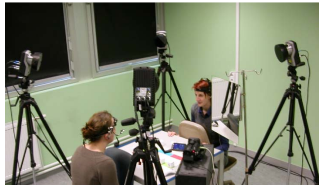
Figure 3: Technical setup of the experiment comprising head mounted eye tracking, head mounted microphones, video recording, and motion capture of head movements.

During the interaction we recorded the subjects' head motions with an HD video camera (both subjects at a time by using a mirror), the subjects' head movements by a motion capture system, the subjects' speech by head mounted microphones, the eye gaze of the reference subject and a video of what she sees by a head mounted eye tracker. Unlike human interlocutors, the eye tracker works on infrared light: it was not affected by the dark glasses. We also monitored the timing of the moves by the log file of the script that controls the experiment. The different data streams are post-synchronized by recording the sync signal of the motion capture cameras as an audio track along with the microphone signals as well as the audio track of the HD video camera, and by a clapper board that is recorded by the microphones, the scene camera of the eye tracker and the motion capture system simultaneously. Figure 3 shows an overview of the technical setup.