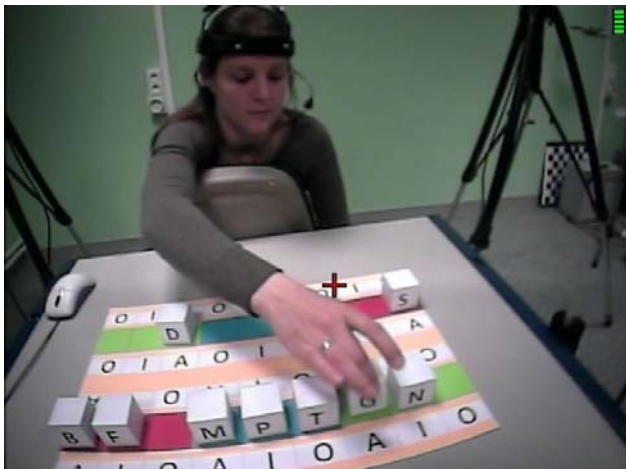
Figure 1: One subject's view recorded by a head mounted scene camera. Here, it is the informant's view: she sees the labels on the cubes and tells the position of the requested cube. The role of the opposite subject (visible in the figure) is manipulator: she requests the position of a cube by telling its label, moves the cube (here the third from six cubes to be moved) and ends the move by a click on the mouse button.

We monitored four interactions of one person (our reference subject) with four different interactants. During the interaction the reference subject acted as manipulator in 6 rounds and as informant in another six rounds, she wore dark glasses in half of the rounds and did not wear dark glasses in the other half. All