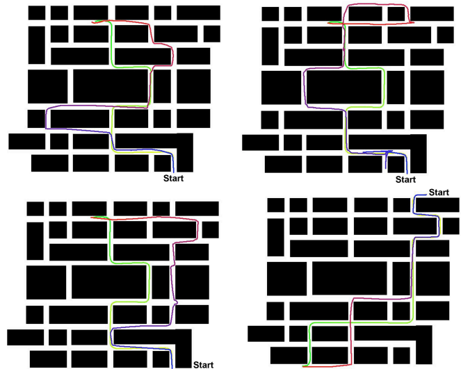
Figure 1: Top-view of the virtual city and archetypal errors observed in the condition where landmarks are removed between memorization and reproduction. In light gray (green), the learned paths. In black (blue to red), the reproduced paths by the participant. For example, in the top-right panel, note how the central building was passed from the right in the learned path, and from the left in the participant’s reproduction.

In this paper, we propose a probabilistic model that tackles this problem in an original manner. We develop a model of navigation, which, although composed of a single component, can mimic both landmark-based and geometry-based navigation strategies. Bayesian inference is the principle, which enables this single representation of the environment to give rise to several navigation strategies. The overall behavior of our model is dictated by the availability of sensory cues. When there are no uncertainties about the sensed landmarks, our model performs as landmark based navigation. On