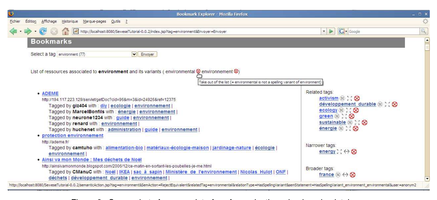
Figure 2. Screenshot of our user interface for navigating a bookmarks database