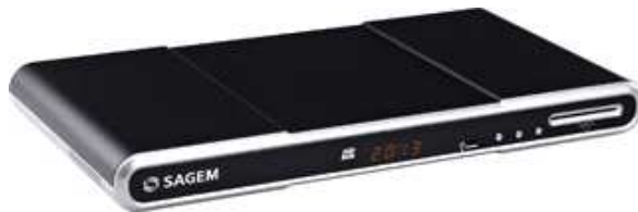
Figure 1: Set top box SagemCom

The product we used for the simulation is a complex set top box for digital terrestrial television, develop by our partner.