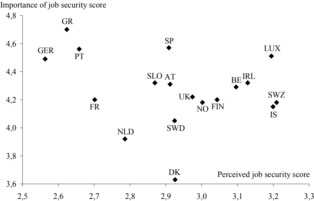
FIGURE 2 Importance of job security and perceived job security

We describe the relationship between perceived job security and its importance in Figure 2. Using mean values by country, we find a positive but insignificant relationship between these two outcomes. At the individual level, perceived job security is introduced in an ordered Probit regression as an additional predictor of the importance attached to security (see Table 2).