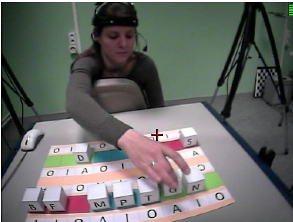
Figure 1 - One subject's view recorded by a head mounted scene camera. This subject's roll is informant: she sees the labels on the cubes and tells the position of the requested cube. The role of the opposite subject (shown in the figure) is manipulator: she requests the position of a cube by telling its label, moves the cube (here the third from six cubes to be moved) and ends the move by a click on the mouse button.