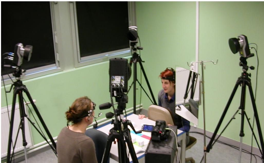
Figure 2 - Technical setup of the experiment comprising head mounted eye tracking, head mounted microphones, video recording, and motion capture of head movements.

During the interaction we recorded the subjects’ heads with an HD video camera (both subjects at a time by using a mirror), the subjects’ head movements by a motion capture system, the subjects’ speech by head mounted microphones, and the eye gaze of the reference subject and a video of what she sees by a head mounted eye tracker. We also monitored the timing of the moves by the log file of the script that controls the experiment. The different data streams are post-synchronized by recording the shutter signal of the motion capture cameras as an audio track along with the microphone signals as well as the audio track of the HD video camera, and by a clapper board that is recorded by the microphones, the scene camera of the eye tracker and the motion capture system simultaneously. Figure 2 shows an overview of the technical setup.