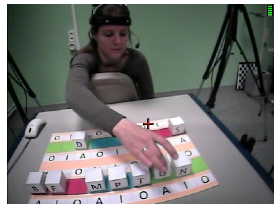
Figure 1 - One subject's view recorded by a head mounted scene camera. This subject's roll is informant: she sees the labels on the cubes and tells the position of the requested cube. The role of the opposite subject (shown in the figure) is manipulator: she requests the position of a cube by telling its label, moves the cube (here the third from six cubes to be moved) and ends the move by a click on the mouse button.