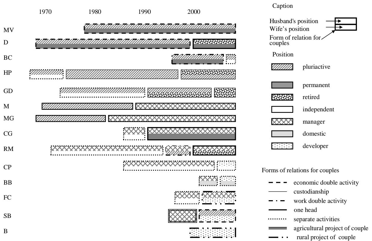
Figure 1. Family careers in the cases studied.