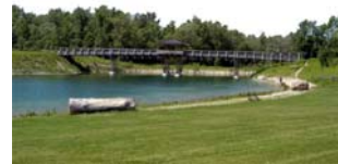
Figure 5 and 6: Solar City: permanent and temporary wet areas