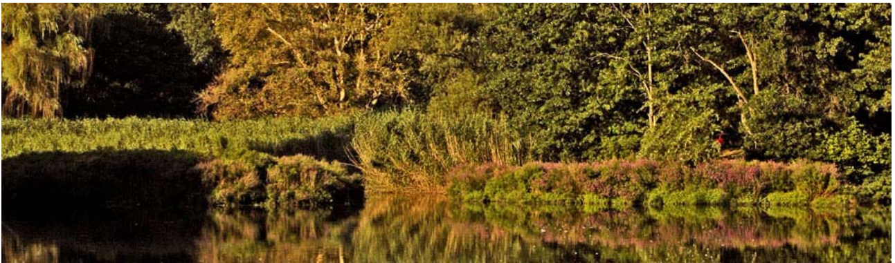
Figure 3: A view of the park

Olmsted's plan for Boston's park system, known as the «Emerald Necklace» consists of several small parks that are linked by tree-lined roads called parkways. This concept of separate but connected parks provided a way to link newly-added areas to the traditional city center while providing several forms of recreation for area inhabitants such as pleasure driving, picnicking, and hiking [figure 3].