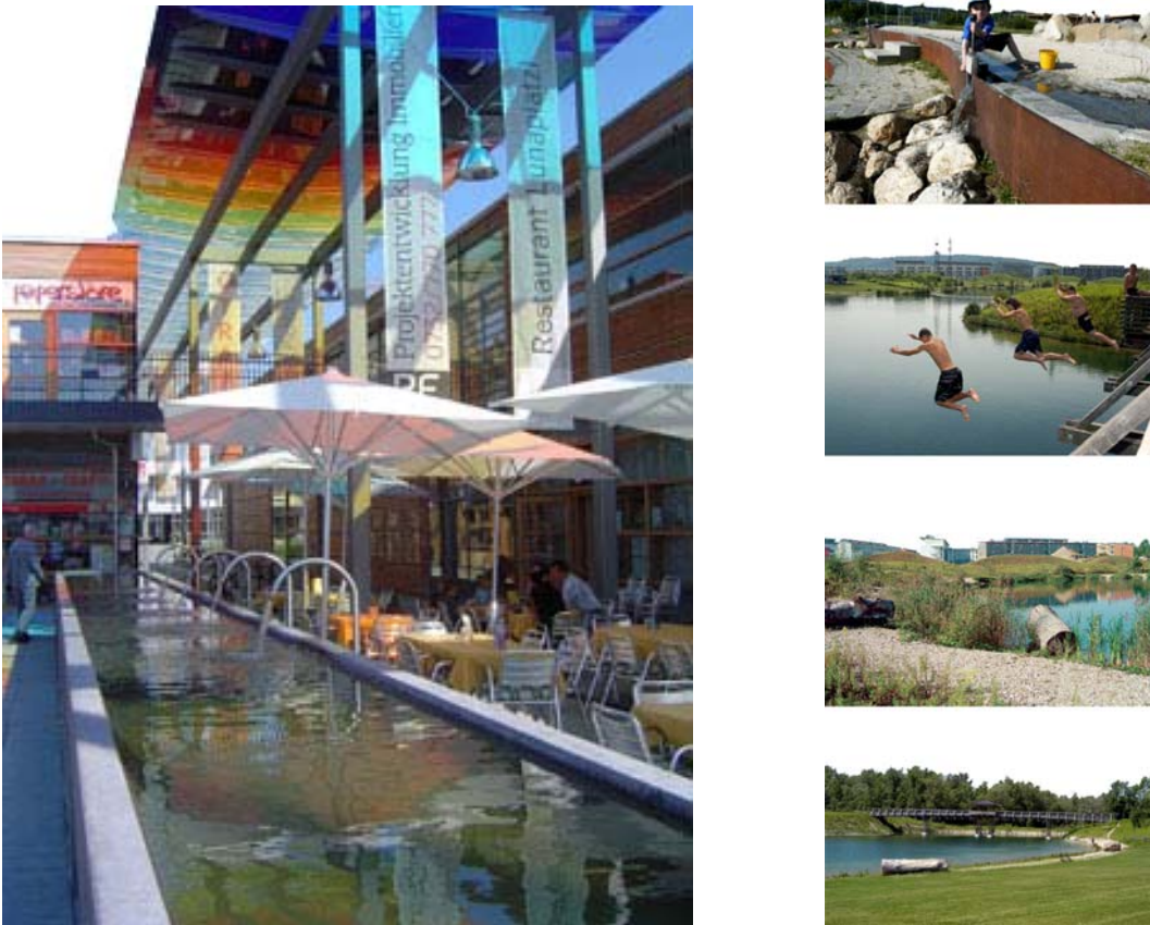
Figure 5 and 6: Solar City: permanent and temporary wet areas