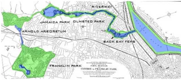
Figure 2: Olmsted archives, Boston Park System

Olmsted's plan for Boston's park system, known as the «Emerald Necklace» consists of several small parks that are linked by tree-lined roads called parkways. This concept of separate but connected parks provided a way to link newly-added areas to the traditional city center while providing several forms of recreation for area inhabitants such as pleasure driving, picnicking, and hiking [figure 3].