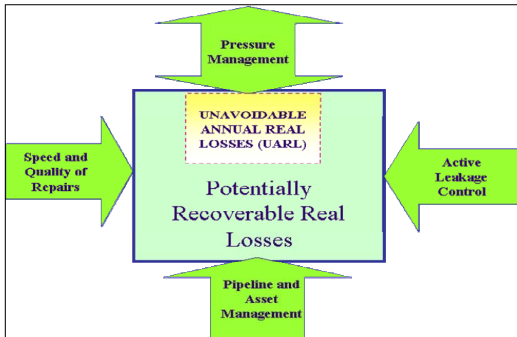
Figure 1: Components of water loss management strategy, as developed by IWA (Source: Liemberger and Farley, 2004)

In order to minimise overall leakage rates in a distribution network, a water utility needs to carry out active leakage management, which is simply described as detection of leakages before they appear on the surface, using various technical equipment. Effective active leakage management requires high levels of technical and organisational capacities on the part of the water utility. So when the water utility mobilizes resources for detection, location and repair of reported leaks only, we are talking about passive leakage control.