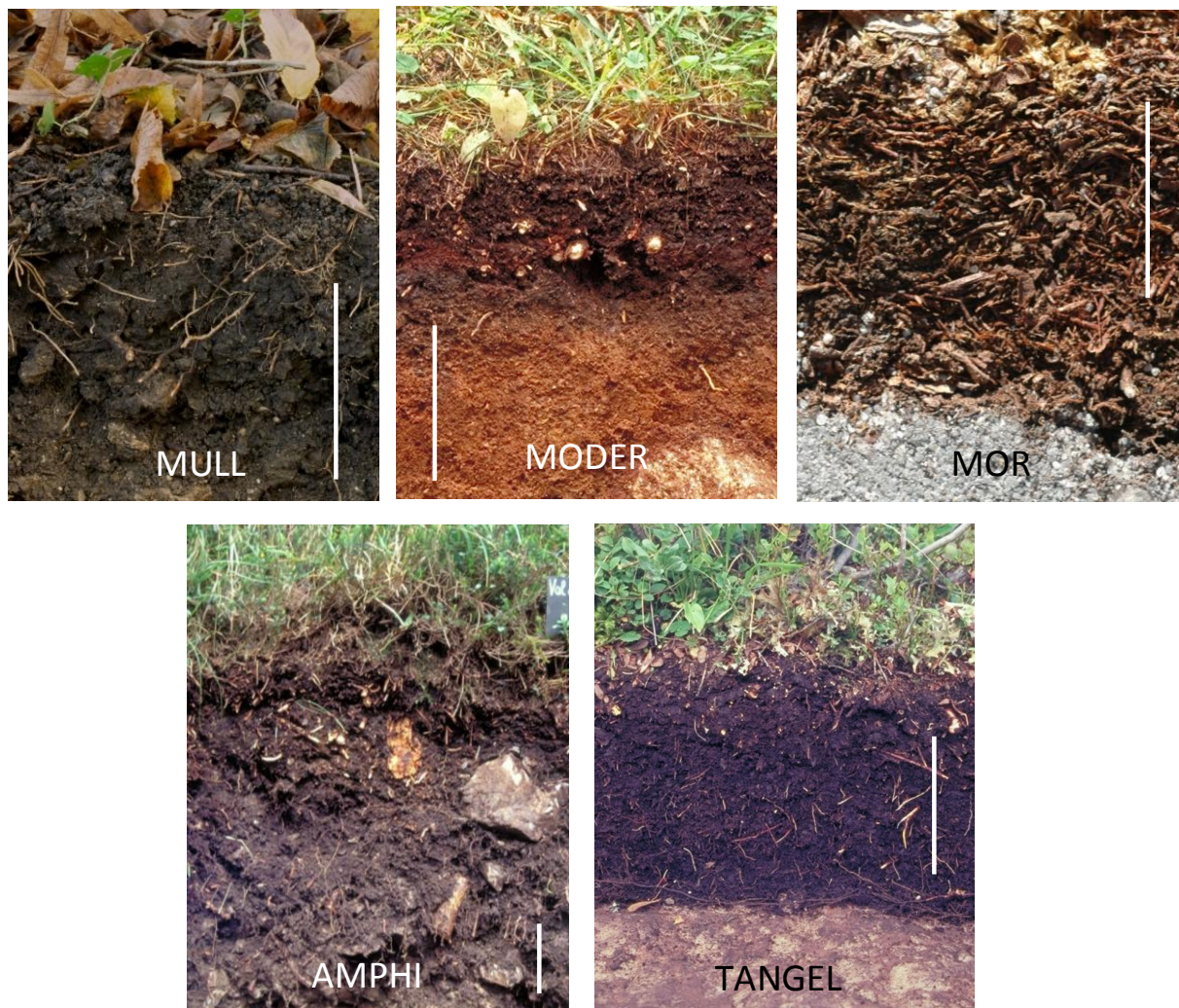
Fig. 1. The five main terrestrial humus forms prevailing in temperate ecosystems (bar = 10 cm)

The Humus form, i.e. the part of the soil which is influenced by organic matter (Brêthes et al., 1995), has been recognized for a long time as the seat of most biological and physico-chemical processes essential to soil development and terrestrial ecosystem functioning. This concept applies to every kind of soil the upper part of which (the topsoil) is not permanently disturbed by human activity, i.e. to all non-tilled soils. In his seminal work, Müller (1879, 1884, 1887, 1889) put the basis of a multifaceted assessment of humus forms, embracing pedology, silviculture, biology, geology and climate. More than half a century later, Kubiëna (1953) classified European soils, considering the interaction between soil animals and vegetation as the driving force of soil development, geology and climate being the context. However, it is only recently that the concept emerged of humus forms as a digest of major processes which shape and stabilize ecosystems, pointing to the need for a better and worldwide assessment of diagnostic characters of humus forms (Ponge, 2003; Graefe & Beylich, 2006).