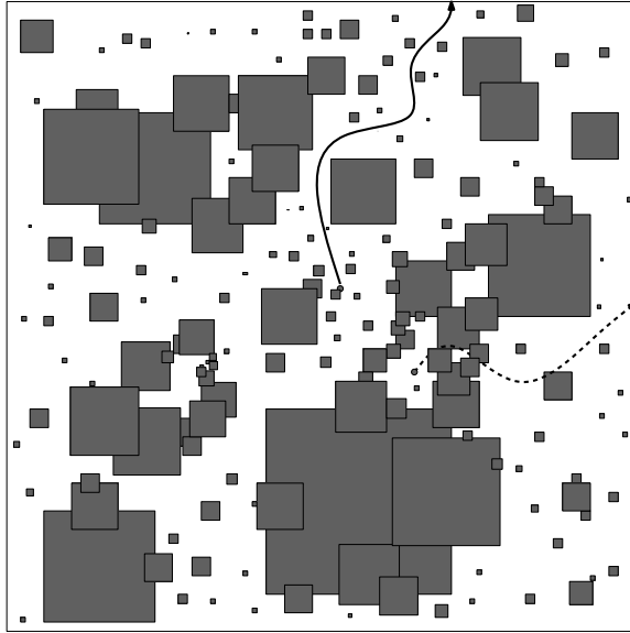
Figure 1: Sketch of a Poisson square soup. The point at the end of the solid line can be connected to the boundary by a path that does not cross the soup, and thus belongs to the carpet. The point at the end of the dotted line is completely surrounded by the soup and thus is not in the carpet.

Poisson models. A natural way to obtain stronger scale and translation invariance is to define the set F by removing from [0, 1]^2 all squares of a statistically translation-invariant and scale-invariant Poisson point process of squares. In fact, one could also replace these squares by other planar shapes, such as line segments or disks. This gives rise to self-similar Poisson percolation models, as studied for instance in [26, 27, 4]. In these papers, the focus is on the existence and the nature of the phase transition for the connectivity property of F in terms of the intensity c of the Poisson point process (that replaces the factor \log(1/(1-p)) ): For small c (i.e. small p ), the set F can have non-trivial connected components, and one can define the “carpet” G that consists of all points of (0, 1)^2 that can be connected to the boundary of the unit square by a path that remains in F (a typical point in F will in fact not satisfy this property; see Figure 1 for an example, and section 4.1 for a more complete discussion).