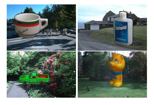
Figure 1. Synthetic database.

We compared the three graph kernels we presented presented in this paper (Eq. (1), (2) and (3)) in the context of interactive object retrieval. Each retrieval session