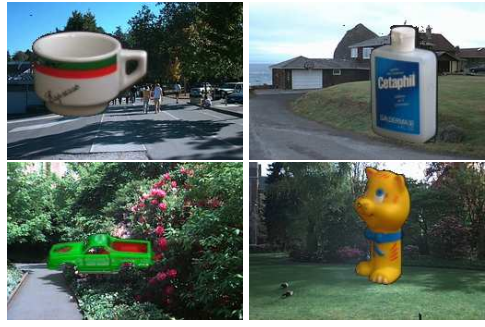
Figure 1. Synthetic database.

We compared the three graph kernels we presented in this paper (Eq. (1), (2) and (3)) in the context of interactive object retrieval. Each retrieval session