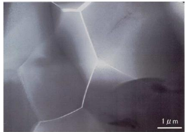
Fig. 2 Transmission electron micrograph of as-irradiated AlN (fast neutrons, E > 0.1 MeV, 17 dpa).

On the other hand, Yano et al. showed that aluminum nitride swelling induced by irradiation is directly related to the swelling of the unit cell volume [31,32]. Moreover, they demonstrated that the swelling of its wurtzite structure is anisotropic: unit volume increases when fluence increases. This anisotropic swelling, also noted in other materials that have anisotropic structures [33-37], leads to stress in the irradiated area, inducing, in polycrystalline material, fractures or microcracks at the grain boundaries (see Fig. 2 [38]).