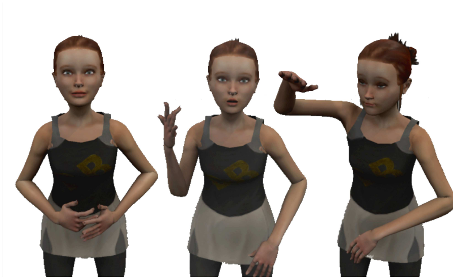
Fig. 3. Screenshots of the virtual signer "Sally" from the Signcom project