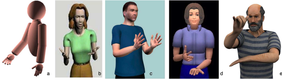
Fig. 1. Some virtual signers classified in chronological order: (a) the GESSYCA system [10] (b) Elsi [8] (c) Guido from the eSign european project [20] (d) the virtual signer of the City University of New-York [17] (e) Gerard [2]

to express concisely ideas or concepts. This intricate nature is difficult to handle with classical animation methods, that most of the time focus on particular types of motions (walk, kicks, etc.) that do not exhibit a comparable variability and subtleties.