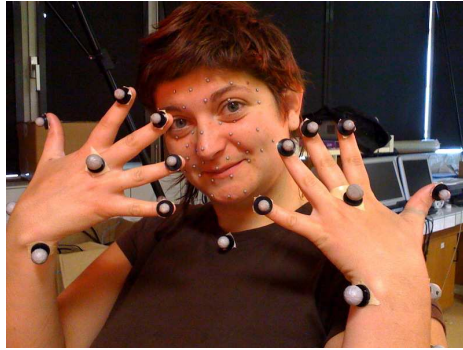
Fig. 2. Photo of the motion capture settings in the Signcom project

sign language notation system as a base, the eSign project has further designed a motion specification language called SigML [7]. Other XML -based description languages have been developed to describe various multimodal behaviors, some of these languages are dedicated to describe conversational agents behaviors, as for example MURML [24], or describe style variations in gesturing and speech [30], or expressive gestures [11]. More recently, a unified framework, containing several abstraction levels has been defined and has led to the XML -based language called BML [36], which interprets a planned multimodal behavior into a realized behavior, and may integrate different planning and control systems.