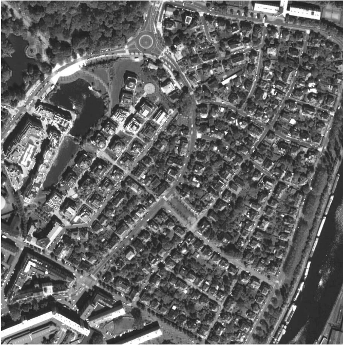
Fig. 2. Source image