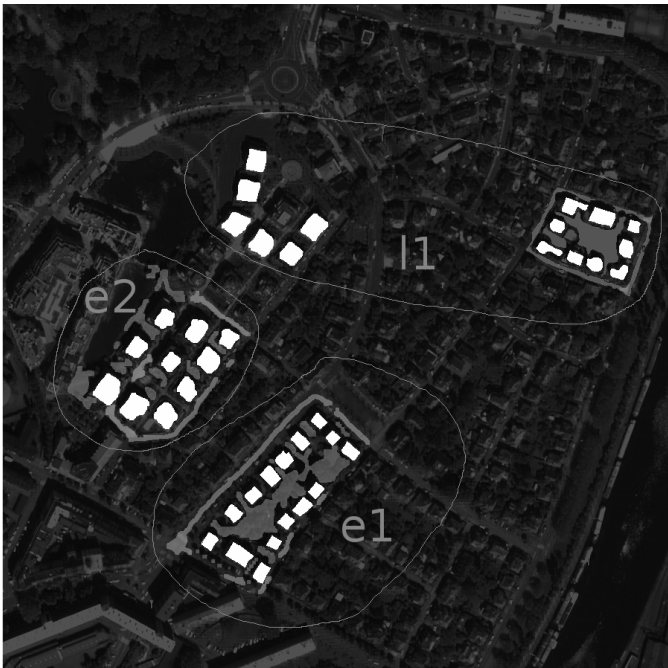
Fig. 3. Labeled regions for learning (l1) and evaluation (e1 and e2)

where i is the considered class, N_{S_i} is the number of segmented regions which contain at least one pixel of the i^{th} class and N_{R_i} is the number of expert regions for the i^{th} class. After over-segmentation, under-segmentation must be evaluated. Using only the over-segmentation criterion, a segmentation which produces only one segment for the whole image will be the best so there is a need for another criterion. Under-segmentation occurs when a segment contains pixels from two regions of different classes, this reduces the maximum accuracy of an image classification. Theoric maximum accuracy ( TMA ) of a subsequent classifier represents the under-segmentation. By exemple, if the TMA is 63%, the classification of the image could not be better than 63%. For this criterion, the label of a segment is the class that has more referenced pixels in this segment. A confusion matrix C can be extracted from this classification step using N_{Ref} classes. TMA is defined as: