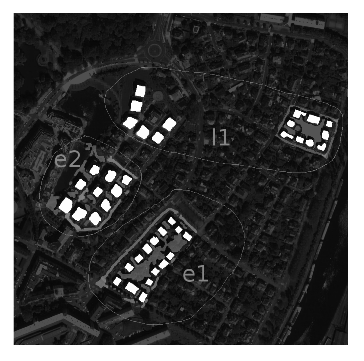
Fig. 3. Labeled regions for learning (11) and evalution (e1 and e2)