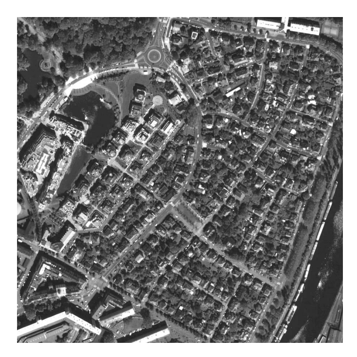
Fig. 2. Source image