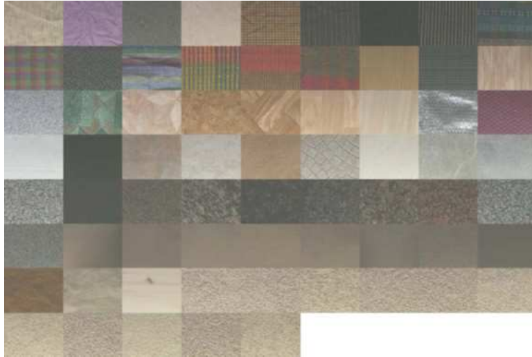
Fig. 3. Examples of the 68 textures of Outex 14 [5].

ignored, or vectorially, where all channels are processed simultaneously. From a practical point of view, vectorial processing is implemented with the help of a vector ordering scheme [6]. Nevertheless, in this case the choice of ordering method is of vital importance and can influence strongly the end result. During our experiments we chose to use the Euclidean norm ( \|\cdot\| ) based ordering: