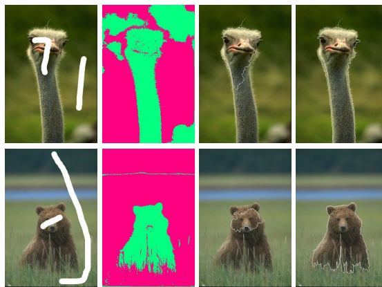
Fig. 1. Comparative results (from left to right): input image with markers, classical supervised pixel classification, classical marker-based watershed segmentation, and proposed approach.

The computational cost of the proposed approach is of course higher than the classical marker-based watershed as it also involves a supervised pixel classification. However, it is still reasonable and as been measured around 15 seconds with a Java-based implementation on a Pentium M 1.1 GHz / 1 GB RAM laptop.