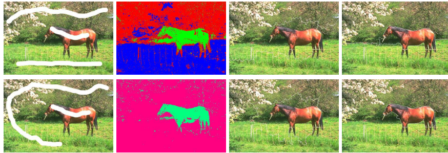
Fig. 3. Influence of the number of markers on the results (from left to right): input image with markers, classical supervised pixel classification, classical marker-based watershed segmentation, and proposed approach.