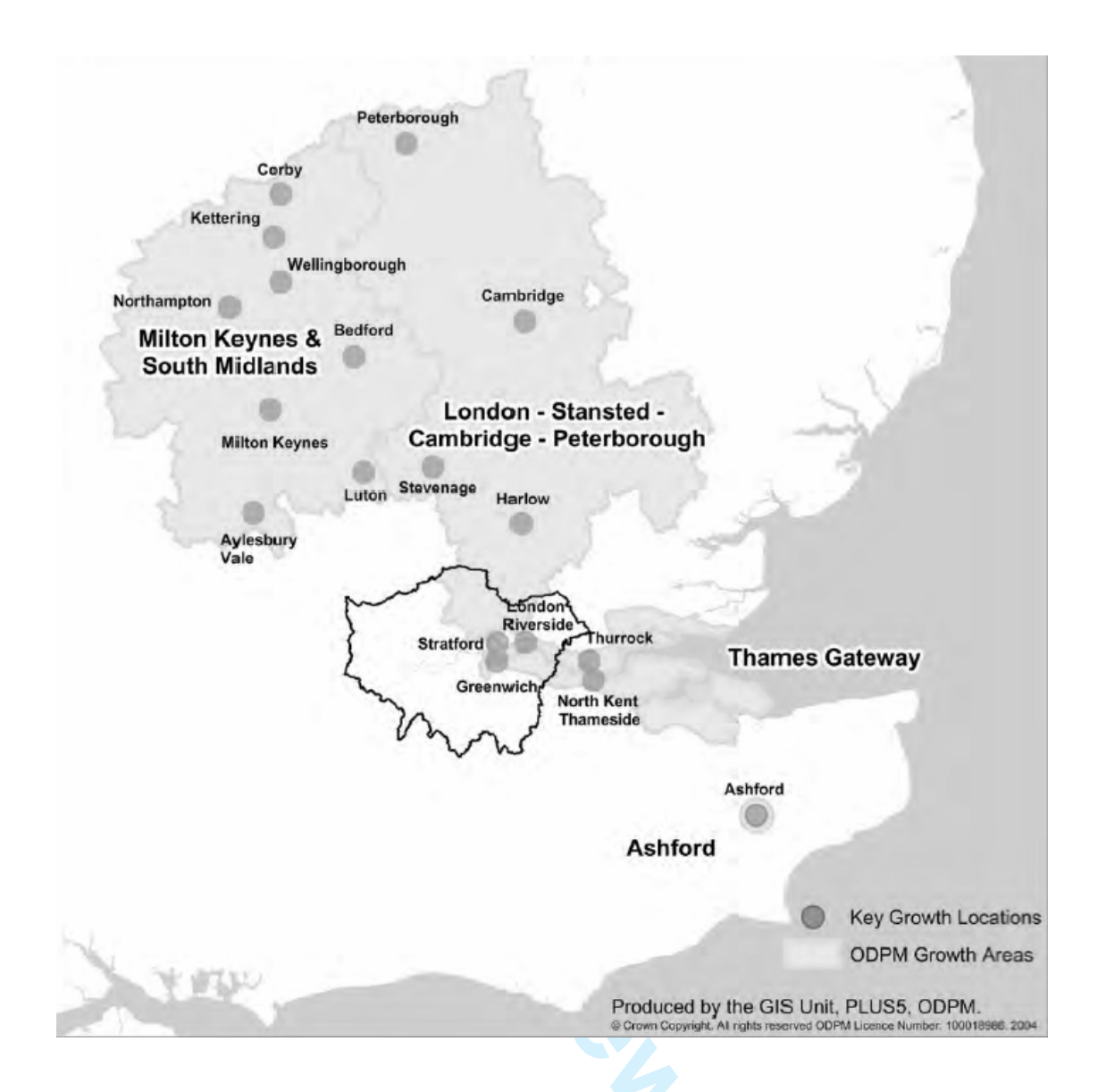
Figure 1 The Growth Areas