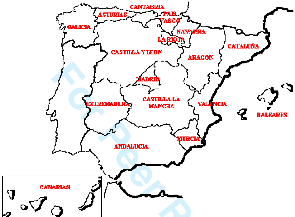
Figure 2: Map of Spanish Regions

1 2 3 4 5 6 7 8 9 10 11 12 13 14 15 16 17 18 19 20 21 22 23 24 25 26 27 28 29 30 31 32 33 34 35 36 37 38 39 40 41 42 43 44 45 46 47 48 49 50 51 52 53 54 55 56 57 58 59 60