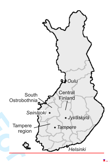
FIGURE 1. The location of the cases in Finland

Global and national developments and policies are intertwined and they have clearly influenced local developments. However, we also demonstrate how local developments and policies have fed into larger developmental patterns, making it possible to talk about the 'co-evolution' of national and local developments, rather than simply about top-down or bottom-up policies, or multi-level governance. Our aim is not, however, to replace the concept of multi-level governance with co-evolution but to complement it, by showing that the relationship between various levels is not a static but a dynamic one. At the same time, if we want to better understand the role that various actors at various levels play in economic development, we need to be more sensitive to temporal issues.