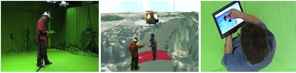
Figure 1: Left: user at Grenoble wearing an HMD in the 3D modeling studio. Middle: all users meet in the virtual environment. Right: user at Bordeaux using a touch pad.

can lead to a rich 3D multimedia experience. We set-up a distributed application involving 3 cities a few hundreds of kilometers apart from each other. At Orléans, a user has simple tele-presence and interaction capabilities (one camera, one large display). The second site at Grenoble hosts a multi-camera system. The user, recorded by the cameras, is modeled in 3D at the camera frame rate. This provides a textured 3D mesh ensuring the user 3D tele-presence on distant sites. On this site the user is equipped with a tracked head-mounted display, ensuring an intense feel of immersion in the shared 3D scene. This site hosts a terrain server providing data to be rendered by each of the three sites. The last location, Bordeaux, also has a multi-camera system for real-time 3D modeling, while visualization takes place on a large display. The user 3D interactions are performed through a touch pad. In the 3D scene, each user can freely move on the terrain and add some simple objects. Users are present in the scene through their 2D or 3D model. Though the networks between the three sites are heterogeneous, the three users were able to interact with a strong feel of presence.