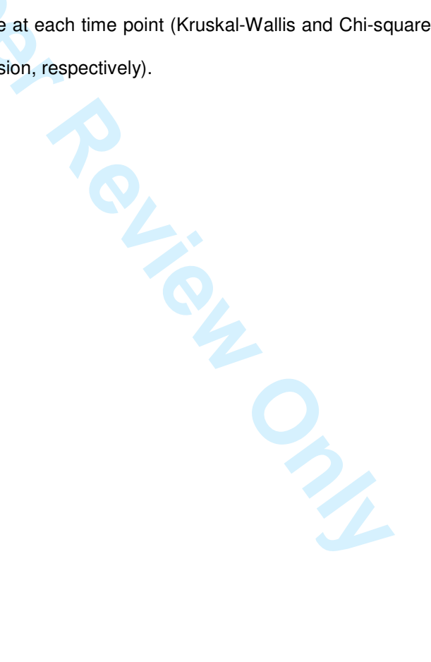
Figure 2. Course of viral load (left panel) and rates of suppressed viral load (right panel) over time according to the three educational levels: None or basic (circles, thick line), secondary (triangles, discontinuous line) and university (squares, thin line). P values represent the comparisons of the values available at each time point (Kruskal-Wallis and Chi-square tests for viral load and rates of viral suppression, respectively).

Figure 1. Course of CD4 counts over time, in all patients and in antiretroviral-naïve and experienced patients, according to the three educational levels: None or basic (circles, thick line), secondary (triangles, discontinuous line) and university (squares, thin line). The values represent the median of all measurements available at each time point, and the P values the comparisons among them (Kruskal-Wallis test).