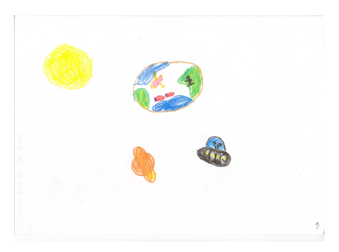
Figure 3. Alexandra's first drawing.