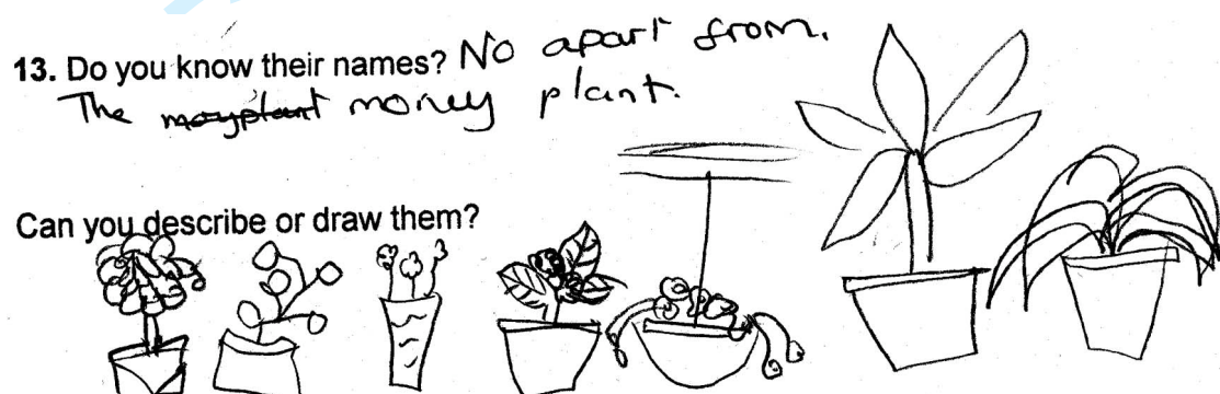
Figure 1 Rendition of plants at home taken from impression sheet Year 6 pupil (age 10 – 11) School B (2000)

some plants, (Figure 1), particularly those they knew well from the indoor home environment, plants such as different types of Cacti and 'spider plants'. Some of these drawings suggest an overt concern to render anatomical characteristics within a plant family such as Cactaceae , (Figure 2). Furthermore, others were keen to iterate their involvement in the care or ownership of these plants, as Figure 3 demonstrates.