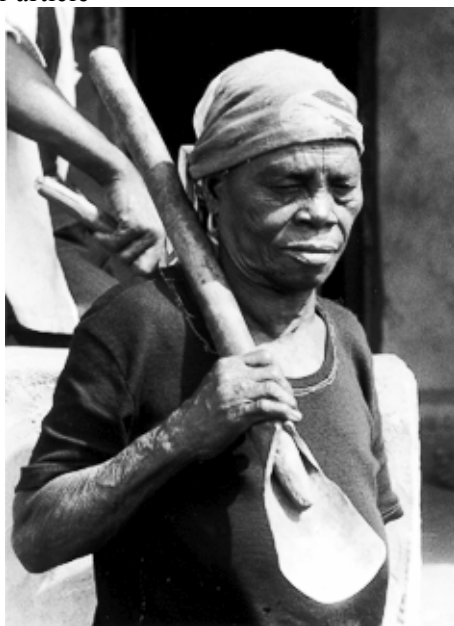
Femme portant une houe-bêche.