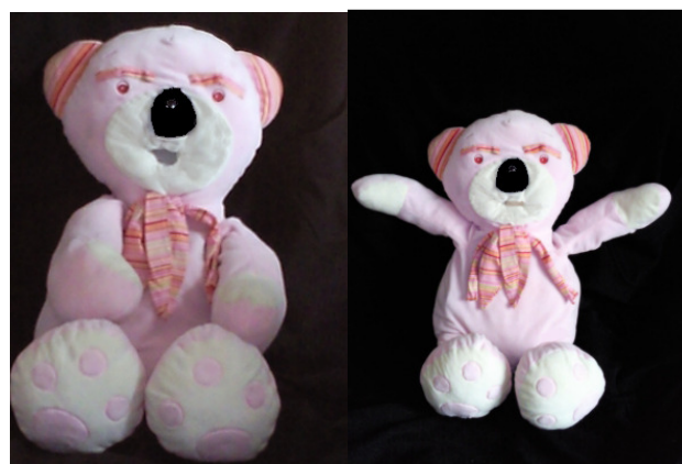
Fig. 2. Entire EmI picture.

EmI (see Fig. 2) is still in integration phase. The robot's mechanics was manufactured by the CRIFF [25], but not its implementation. We are presenting robotics aspects and a brief description of the work already done. Currently, we have it completely covered with plush but not fully padded.