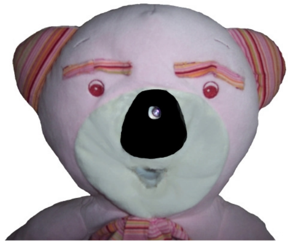
Fig. 6. EmI surprise.

This experiment is substantially identical to that achieved with the simulator in the first instance. Thereafter we will ask users to compare the facial expressions of the simulator to the robot to determine the difference in recognition that there is between the 2 methods and especially to confirm whether the expressions recognized with the simulator are also with the robot