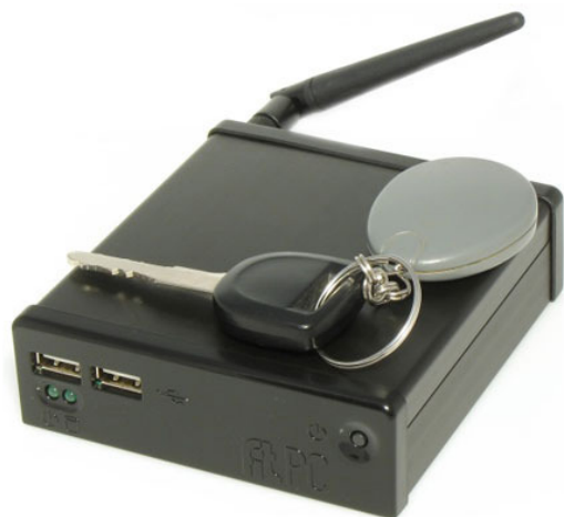
Fig. 5. Fit pc slim.

The torso of the robot is characterized by an aluminum skeleton that allows the robot turns its head, bends, inclines and turns its bust. These movements will allow the robot to follow the user and keep his attention.