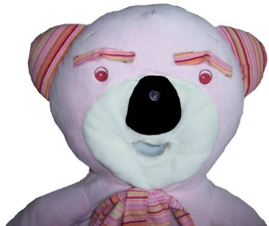
Fig. 7. EmI joy.