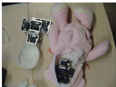
Fig. 4. Body conception

The torso of the robot is characterized by an aluminum skeleton that allows the robot turns its head, bends, inclines and turns its bust. These movements will allow the robot to follow the user and keep his attention.