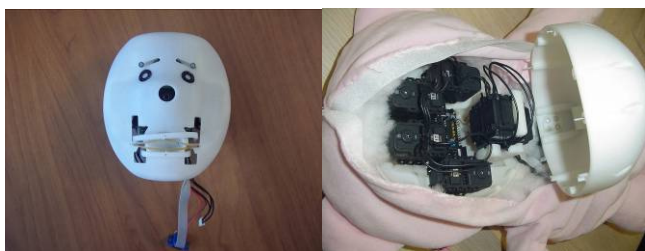
Fig. 3. Head Conception

use to follow the head of the user and try to recognize his facial expression.