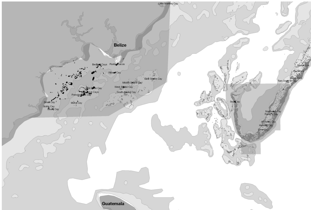
1 Figure 1